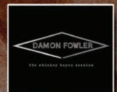
DAMON FOWLER THE WHISKEY BAYOU SESSION