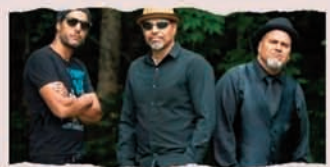
The Blackburn Brothers