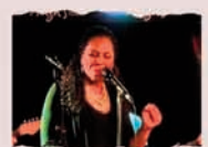
Quisha Wint Quartet