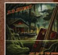
JP SOARS LET GO OF THE REINS