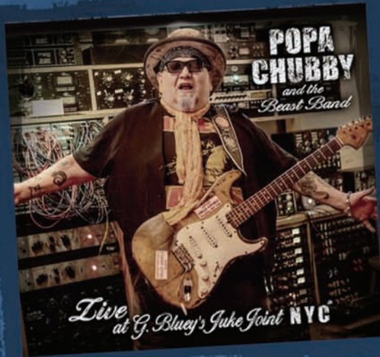
POPA CHUBBY LIVE AT G BLUEY'S JUKE JOINT NYC