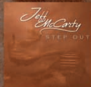
JEFF MCCARTY STEP OUT